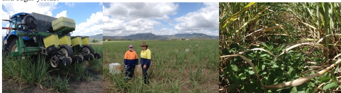
Figure 1: (Left to right) Legume planting into ratooned sugarcane, N 2 O sampling, soybean intercrop.